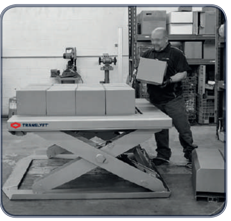
When stacking pallets the FLL helps to ensure that you are always working in the best ergonomic height.