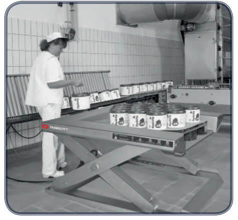
The stainless steel solution makes it perfect for rugged conditions and the use of aggressive cleaning products like in the food industry.

The combination of stainless steel and the FLL standard features makes this lifting table extremely sanitary and thus perfect for the food and pharmaceutical industries and corrosive environments. The FLL is ideal for general materials handling, pallet loading and unloading and packing lines. More information at www.translyft.com