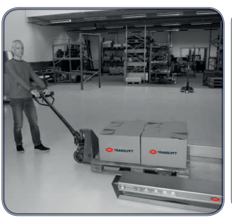
It is easy loading or unloading pallets with the built-in ramp.